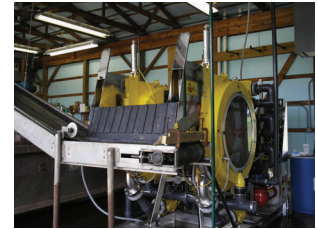
The City Sewer Plant's new sludge rotary machine, shown above, was put into service in mid-July.