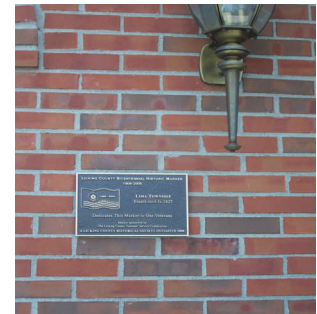
A plaque (shown above) donated by the Licking County Historical Society was installed at Pataskala City Hall commemorating the history of Lima Township.