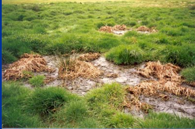
Failed Septic System

http://www.sharedwaters.net/images/failing_septic_system_resized.jpg